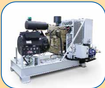
Save floor space with an optional rotary screw compressor / generator.