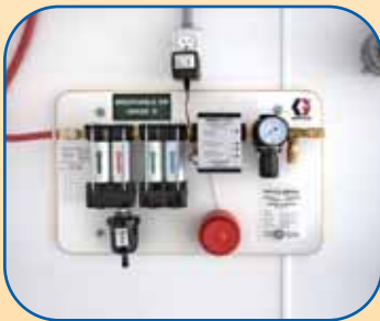
Martech system provides grade D quality breathable air.